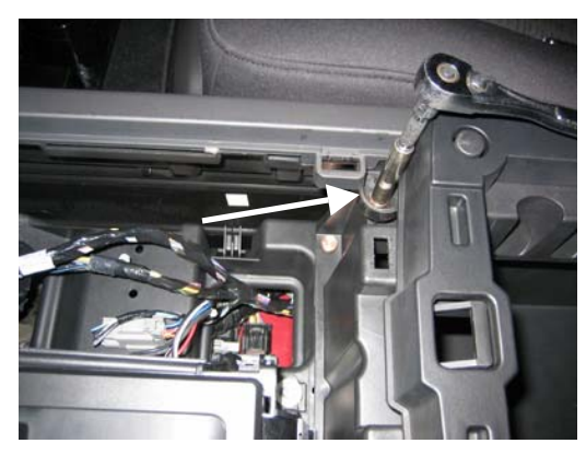
Remove hex head screw from accessory pocket/armrest